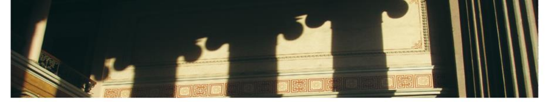
UiO : University of Oslo